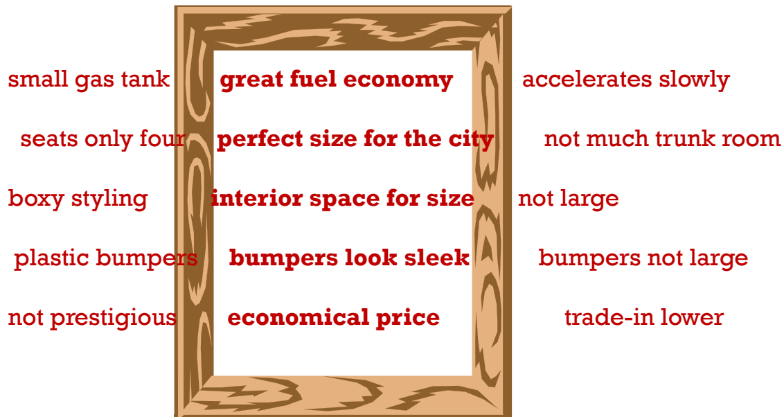
Figure 1. Verbal Framing Visualization