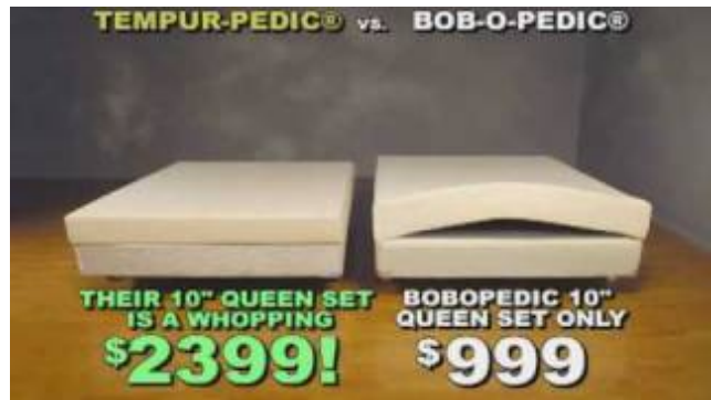
Ad image © Bob's Discount Furniture LLC. All rights reserved. This content is excluded from our Creative Commons license. For more information, see http://ocw.mit.edu/help/faq-fair-use/ .

We see anchoring often. For example, Bob's Furniture, in a play on words, compares their mattresses (Bob-o-Pedic) to brand name mattresses (Tempur-Pedic). Bob's price of $999 seems inexpensive by comparison. We also see "end pricing" in the example. A price of $999 is anchored below $1,000 while a four-digit price of $1,001 would be perceived as much larger.