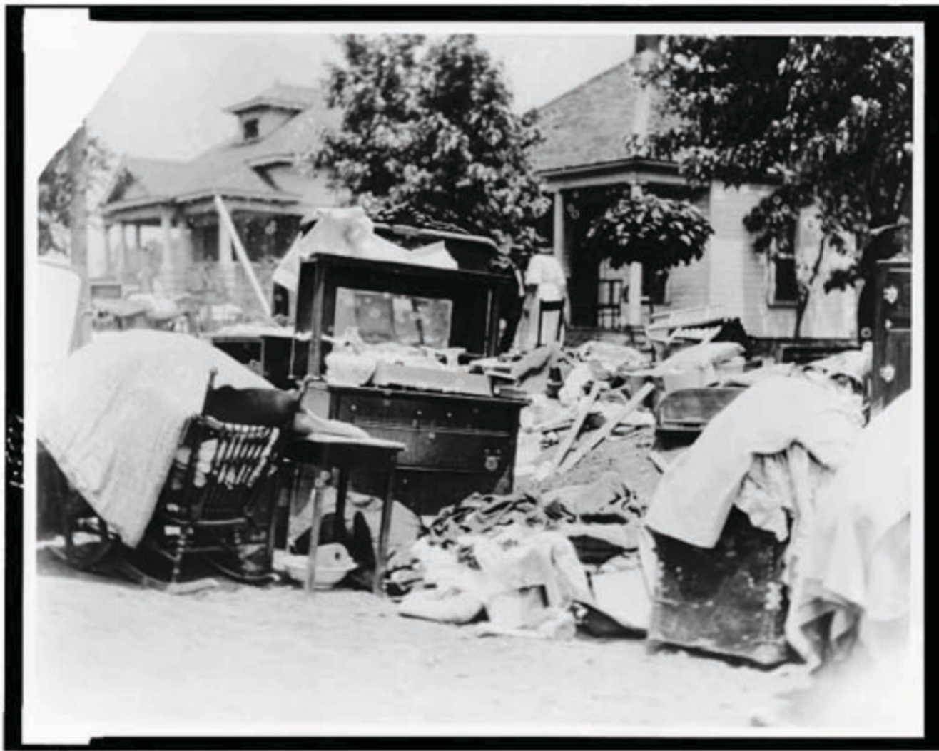
This image is in the public domain.

Title: [Furniture in street during race riot, probably due to eviction, Tulsa, Oklahoma, 1921]