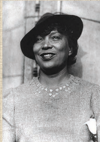
Zora Neale Hurston