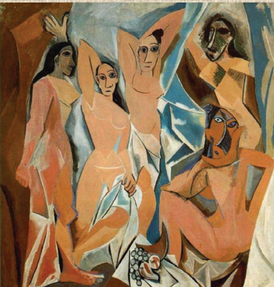
Les Femmes d'Alger