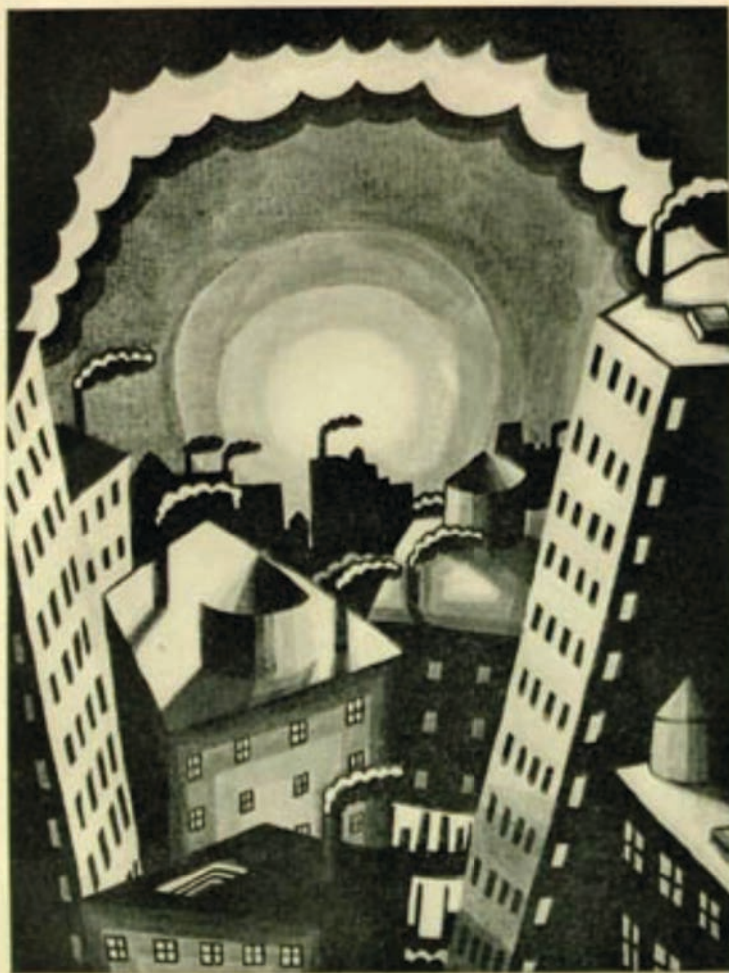
DAWN IN HARLEM