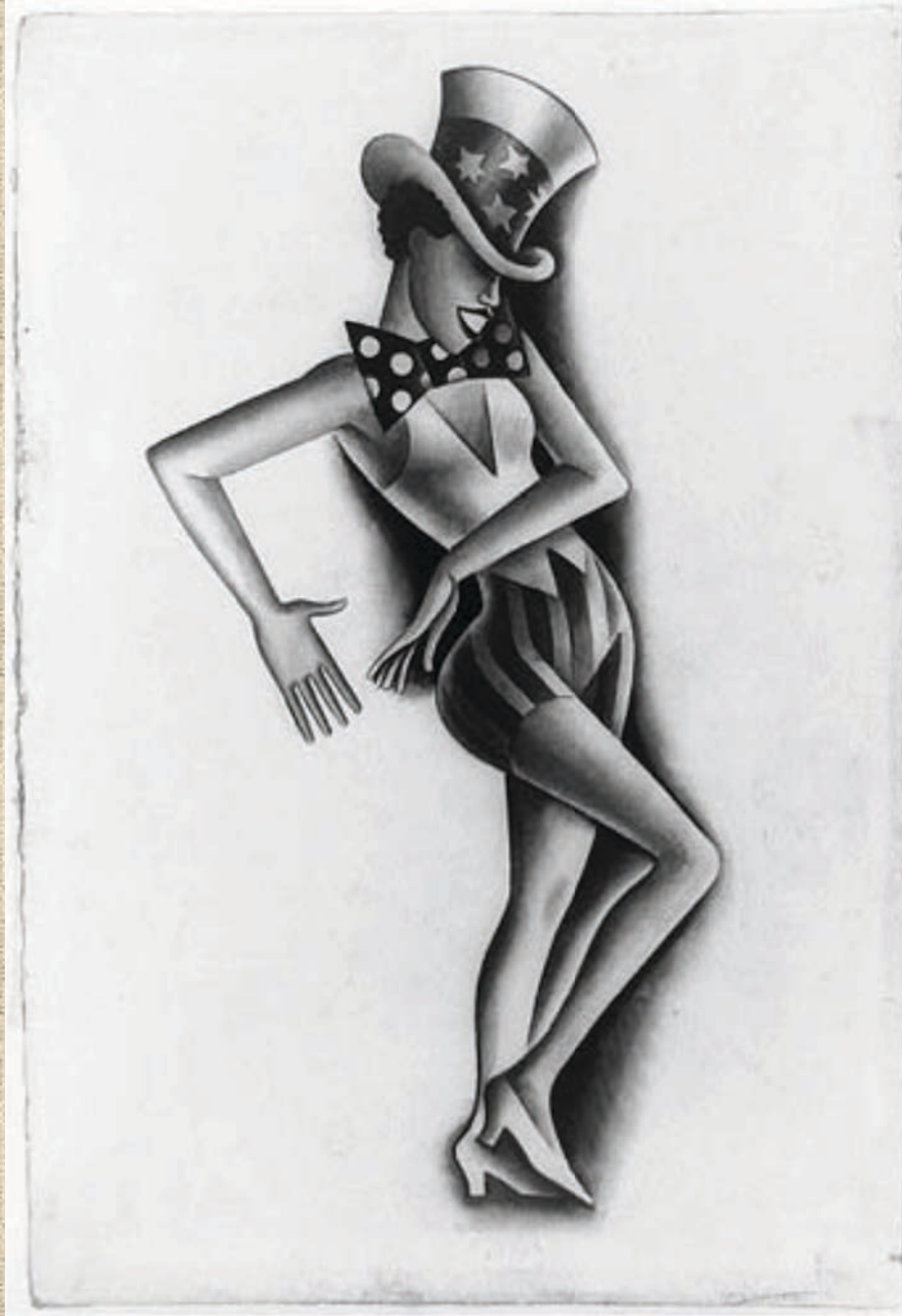
Title: [Cafe au lait, or Cotton Club dancer] Creator: Covarrubias, Miguel, 1904-1957, artist. Date: [1927]

This content is excluded from our Creative Commons license. For more information, see http:// ocw.mit.edu/help/faq-fair-use