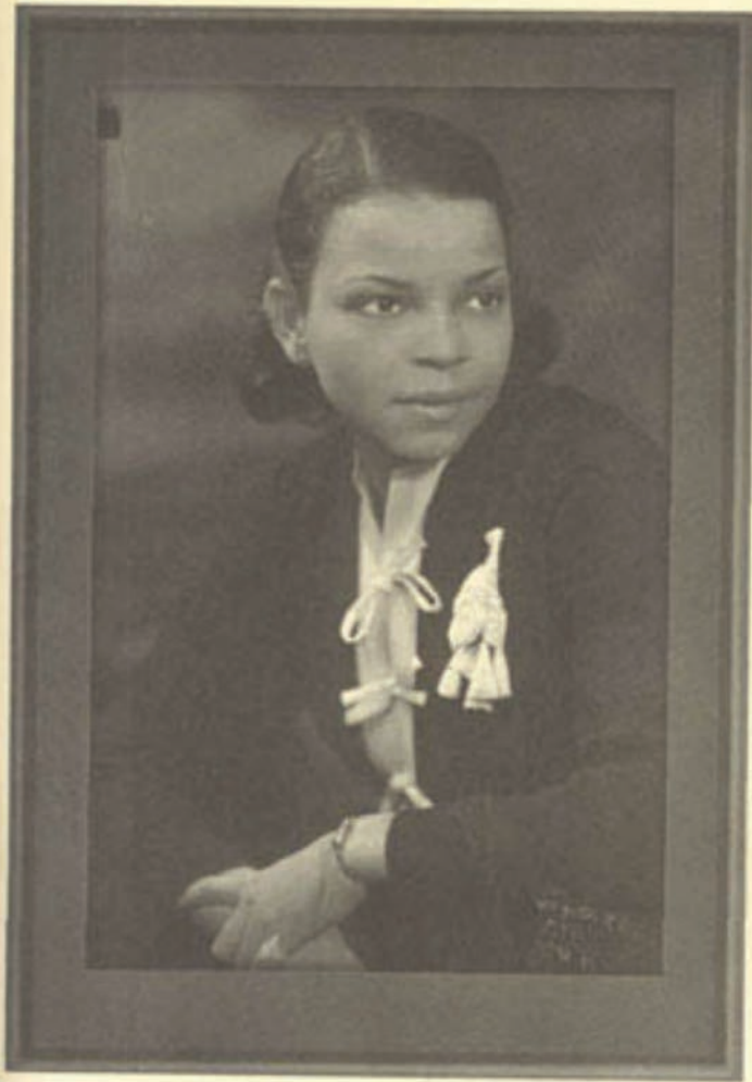
Title: young girl in the 1920s Creator: Van Der Zee, James Date: 1969

© Source unknown. All rights reserved. This content is excluded from our Creative Commons license. For more information, see http://ocw.mit.edu/help/faq-fair-use/