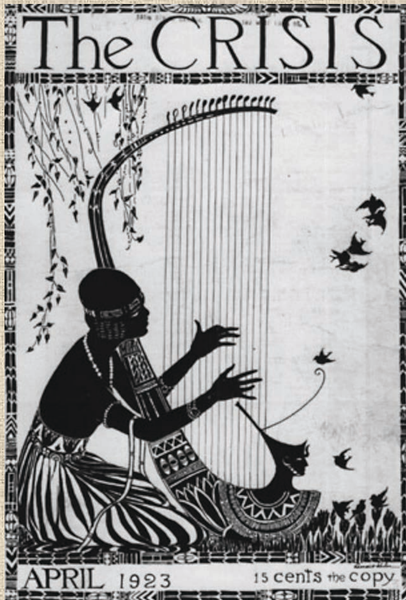
Title: The Crisis Creator: Laura Wheeler Waring Date: [April 1923]

© Prints and Photographs Division, Library of Congress. All rights reserved. This content is excluded from our Creative Commons license. For more information, see http://ocw.mit.edu/help/faq-fair-use/