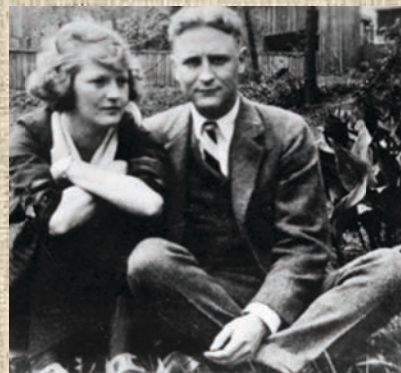
Zelda Sayre & F. Scott Fitzgerald