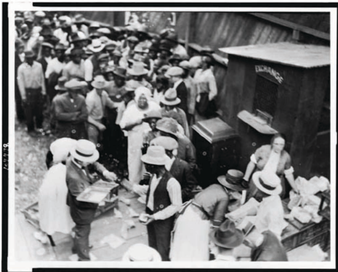
Title: [Tulsa, Oklahoma, race riot, June 1, 1921] Date: [1921]