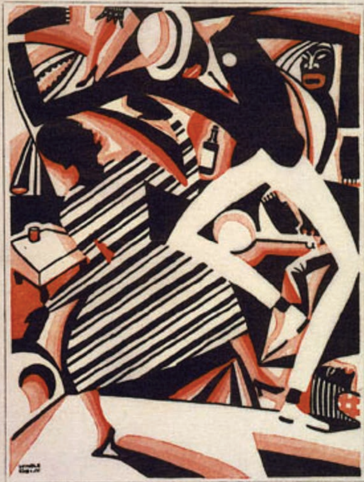
Drawing in Two Colors