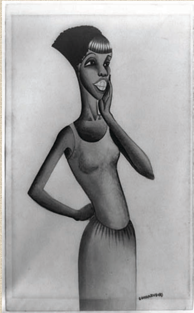
Title: [Santoya, or Seventh Avenue type] / Covarrubias. Creator: Covarrubias, Miguel, 1904-1957, artist. Date: [1927]

All rights reserved. This content is excluded from our Creative Commons license. For more information, see http://ocw.mit.edu/help/faq-fair-use