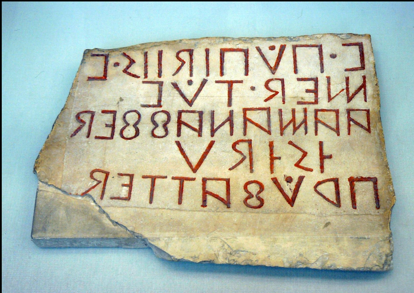
Image courtesy of Félix Potuit. This image is in the public domain. Source: Wikimedia Commons .