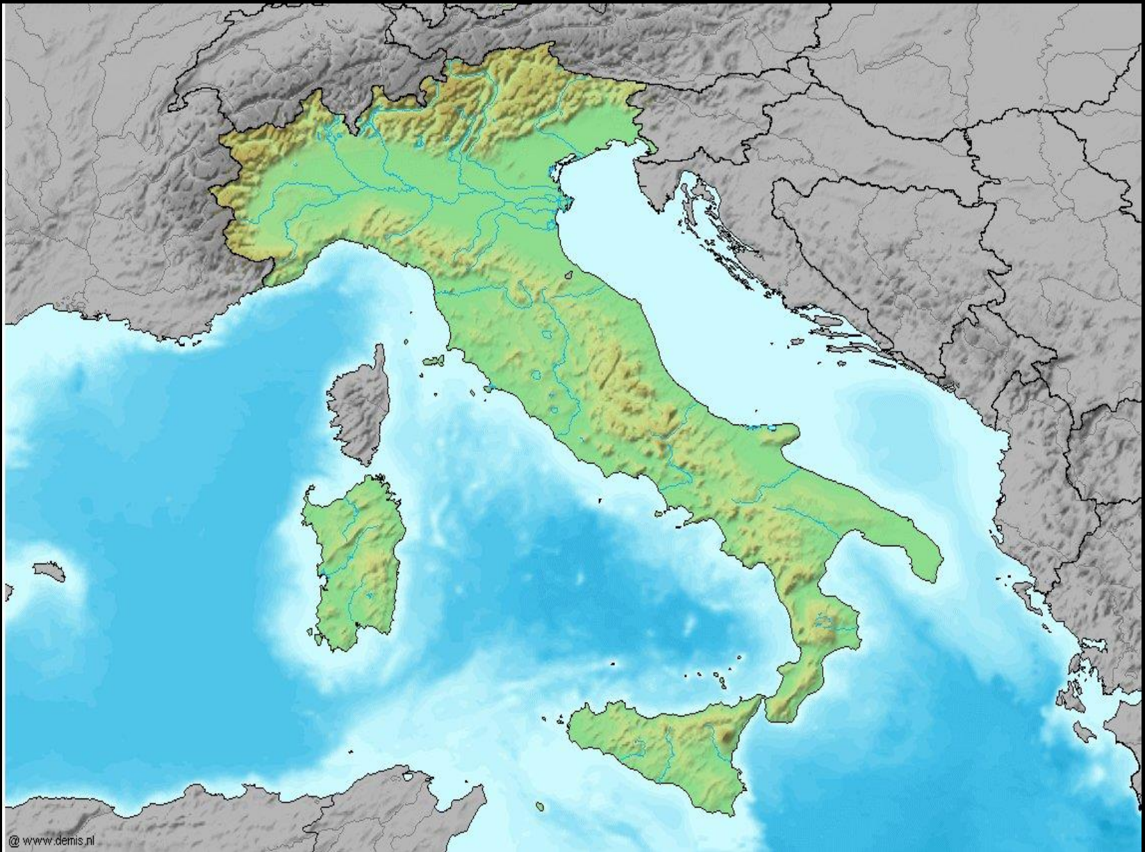
Image courtesy of Fedi. This image is in the public domain. Source: Wikimedia Commons .