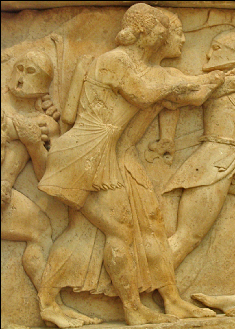
Apollo and Artemis