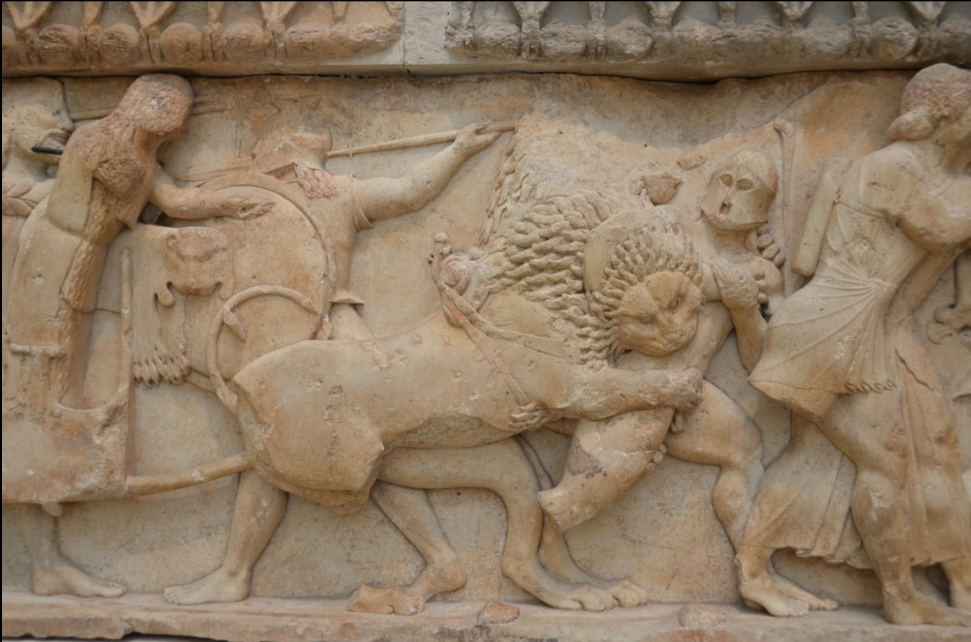
License CC BY-NC-SA.