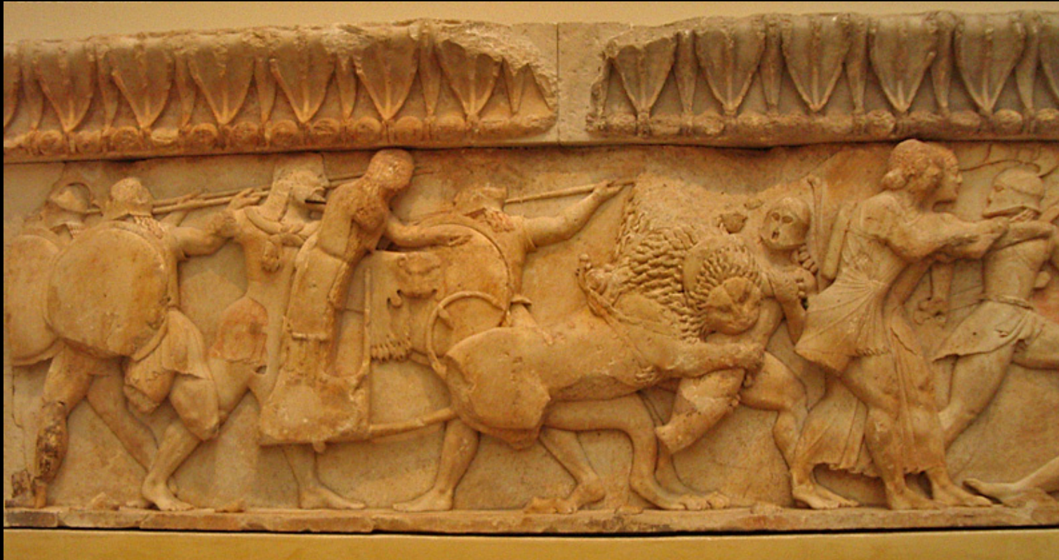
License CC BY-NC-SA.