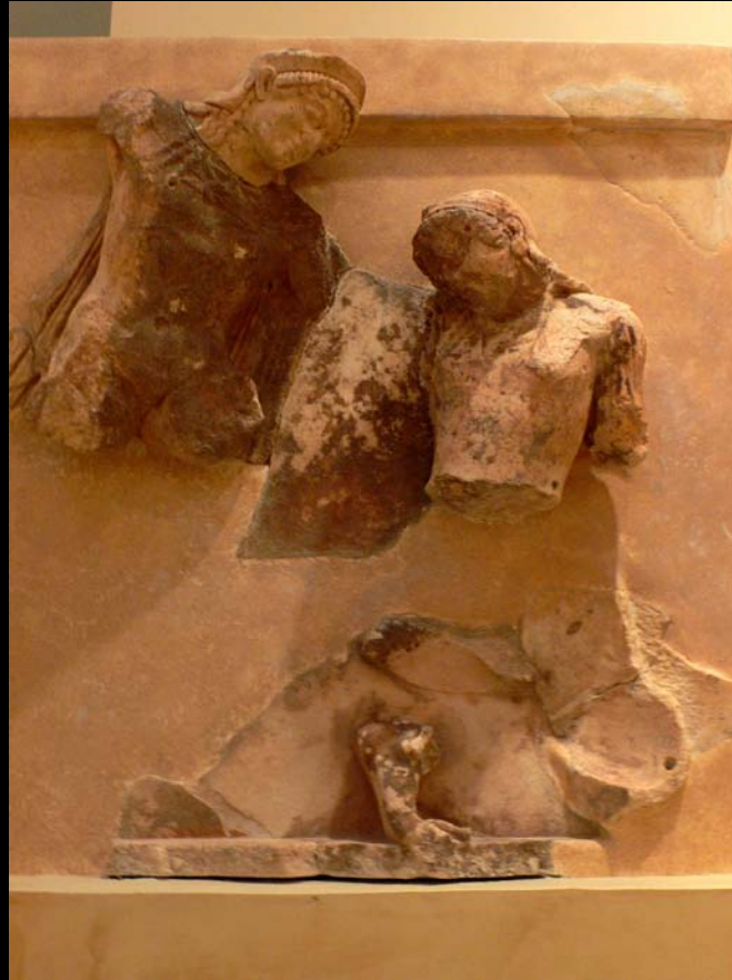
Image courtesy of Nanosanchez . This image is in the public domain. Source: Wikimedia Commons.