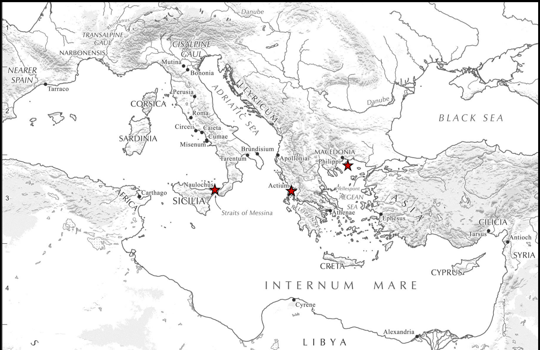
© 2003 Ancient World Mapping Center. Released under CC BY NC 3.0.