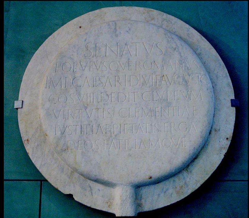
Image courtesy of Marajaara. Source: Wikimedia Commons . License CC BY.