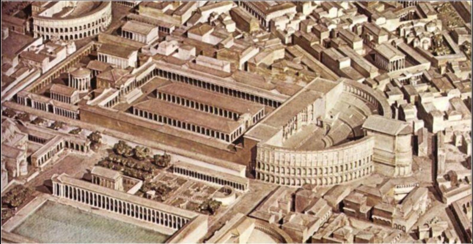
Image courtesy of the Theatrum Pompei Project. This image is in the public domain. Source: Wikimedia Commons .