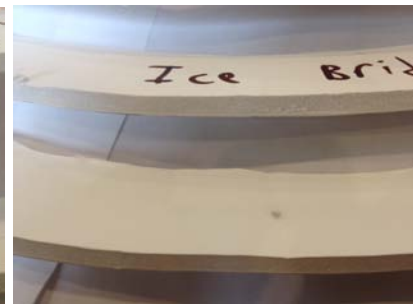
Cannot ascend (an impasse)