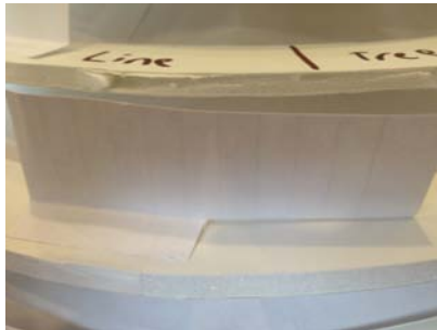
No cost to ascend