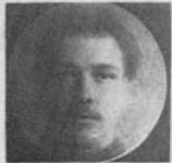
23 Cases. Royal Engineers, 12 Officers, 11 Privates