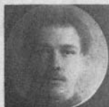
23 Cases. Royal Engineers, 12 Officers, 11 Privates