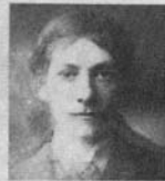
From 6 Members of same Family Male & Female.