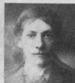
From 6 Members of same Family Male & Female.