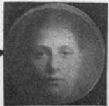
56 Cases Co-composite of I & II