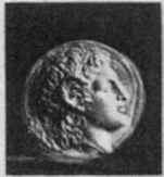
Alexander the Great From 6 Different Medals.