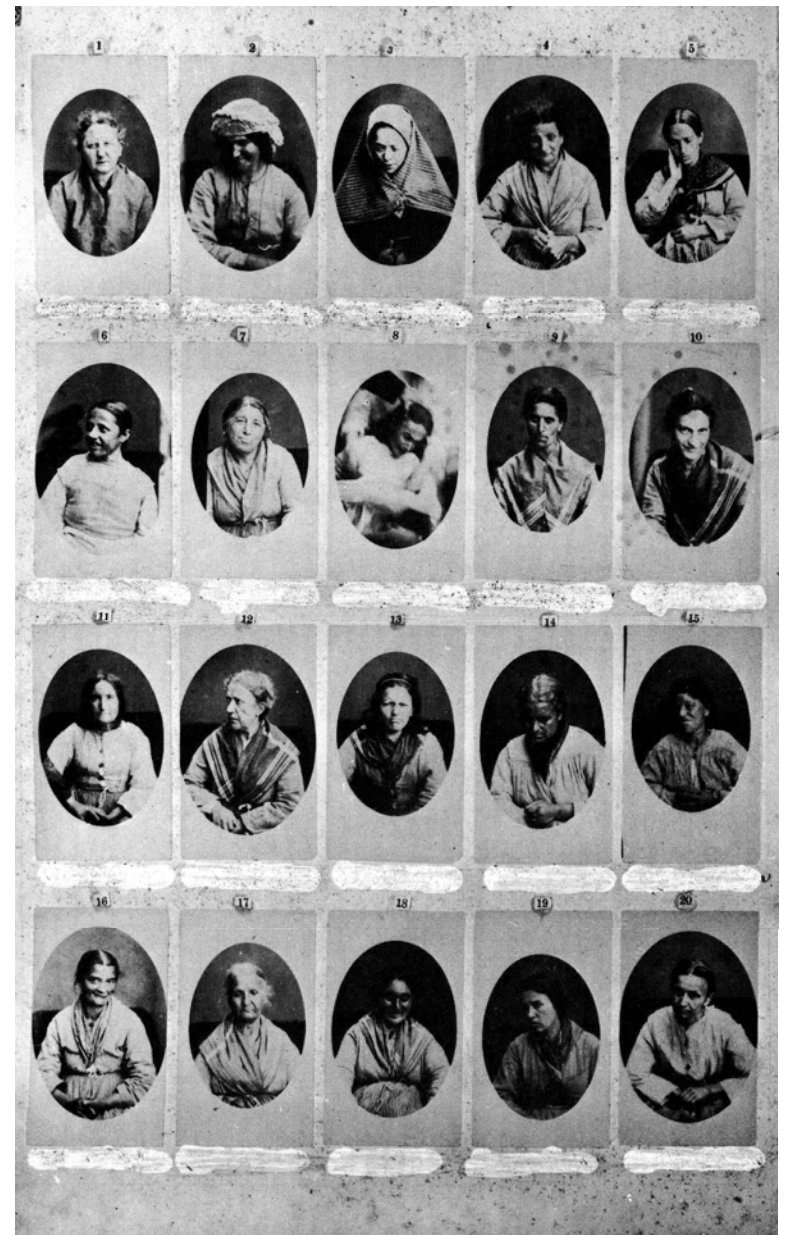
Registry for the San Clemente Hospital, Venice (1873)