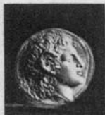
Alexander the Great From 6 Different Medals.